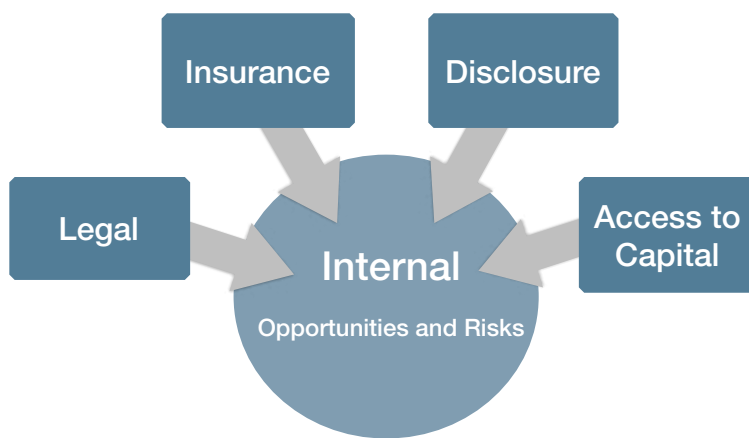
Figure 2. External drivers for business to adapt to a changing climate

Insurance: For the Insurance Bureau of Canada, the evidence is clear: climate change is happening and is affecting their property and casualty insurance offerings. The incidence of natural disasters is increasing, with rising numbers of storms, floods, and other climate-related events driving this trend. Combined with aging infrastructure, climate trends have clear business implications: global insured losses have increased roughly five-fold since 1980. 14 Canada has seen a significant rise in catastrophic insurance losses over the past six years. To the extent that insurance companies can design products to match evolving risk profiles, changes in coverage and pricing can act as incentives for firms to manage climate risks. However, this is difficult