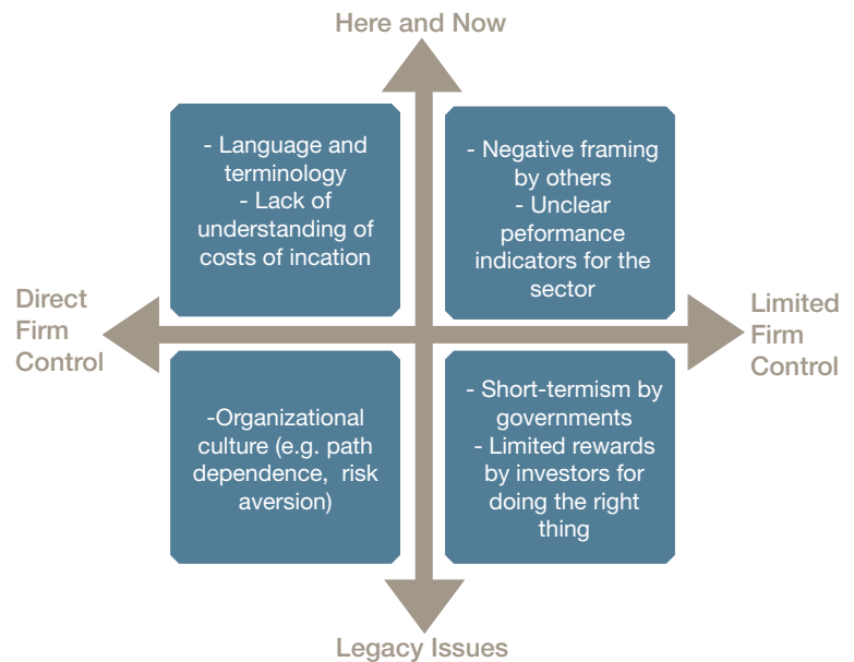
Figure 3. Barriers inhibiting business adaptation to climate change

Other barriers require action by external parties.